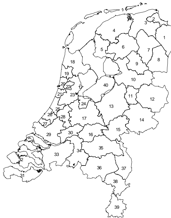
Figure 2.2. COROP regions in the Netherlands

Stratification involves the division of the population into sub-groups, or strata, from which independent samples are taken. The stratification variables are the 40 COROP-regions (NUTS3). These are regional areas within the Netherlands and are used for analytical purposes by, among others, Statistics Netherlands. The Dutch abbreviation stands for Coördinatiecommissie Regionaal Onderzoeksprogramma, literally the Coordination Commission Regional Research Programme. Applying this type of stratification allows for representative samples on a regional level.